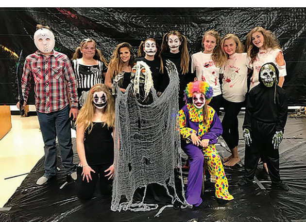
Last year's FCCLA haunted house committee dressed up to scare those who dared to enter.