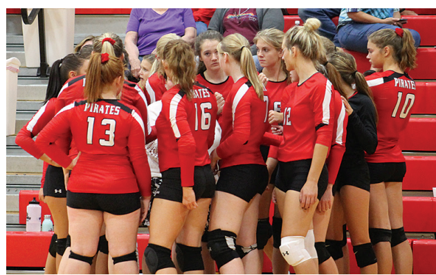
The Varsity Volleyball team huddles up to discuss what they need to fix to win.

Overall, the season hasn't gone exactly as planned for the Pirates, but they still have high hopes and have made vast improvement over the year and over the course of the seniors' careers. As the season comes to a close, the team appreciates the support they have received from fans, and they hope to have more and encourage everyone to attend the last few games.